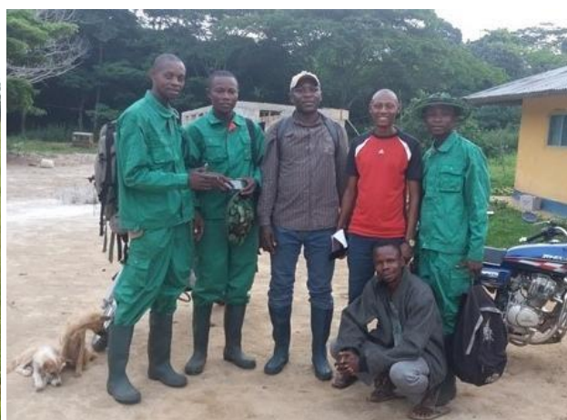
Field work day at MMT: visiting bonobos