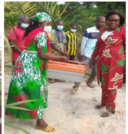
Handing over of tool box to management committee