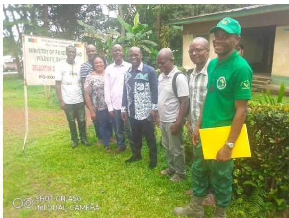
Administrative meeting in Edea between MINFOF and Sekakoh

In late September, following Sekakoh's application for a Memorandum Of Understanding (MOU) with the Ministry of Forestry and wildlife, a delegation of MINFOF cooperation unit visited Sekakoh's project site in Ebo, Littoral region of Cameroon. This was to ascertain and evaluate the existence of Sekakoh in the area while visiting some of Sekakoh's project realizations and to exchange with locals. The first administrative meeting for this evaluation visit was at the Edea divisional delegation of forestry and wildlife and a second meeting in Somakek village with the local population. For 2 days, there were discussions and fields visits to Sekakoh's project sites in Somakek village. The evaluation team upon return to Yaounde gave a positive response to the Minister to sign an MOU with Sekakoh. On 24 th November 2020, the last elaboration meeting for the MOU held in Yaounde at the MINFOF building now pending invitation for final signature for both parties.