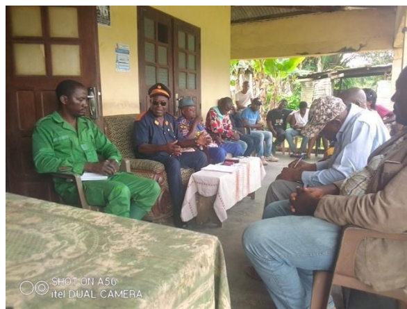
Exchanges with locals in Somakek village with MINFOF