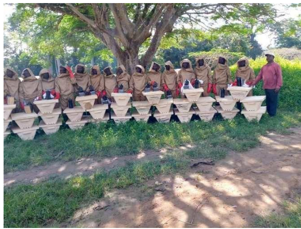
Materials produced at the end of the training