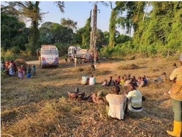
Initiation of borehole construction

As part of community development to support villages living near key biodiversity sites, Sekakoh constructed and handed over a borehole to the population of Labo village, a community that has suffered a persistent lack of potable water. The construction work was led by Diamond Hard Geo services and a completed borehole was handed to the community in the presence of Traditional leaders, the local and civil administration, the local population and a trained and equipped management committee led by a woman was installed.