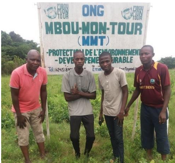
Day 1 at MMT

This year, Sekakoh coordinator undertook an exchange visit to the Democratic Republic of Congo (DRC). This was a visit supported by the French Small Scale Initiatives (PPI) that has support supported Sekakoh's projects since 2018. For two weeks, Sekakoh's coordinator visited Mbou Mon Tour (MMT) in Nkalla, Mai dombe region in the West of DRC to share experiences between Bonobo conservation practices by MMT and The conservation of Nigeria-Cameroon Chimpanzee carried out by Sekakoh in Cameroon. During this visit comprised of field visits to observe bonobos and focused group discussions, the coordinator learnt the MMT approach of community led conservation. Thanks to MMT's effective works the trackers led us to the direct observation of a group of 11 Bonobos.