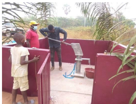
Reception ceremony of borehole in Labo