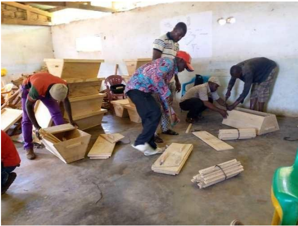
Hands on bee keeping training