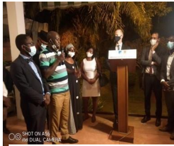
Launching ceremony at French Embassy in Cameroon