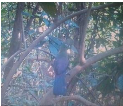
Figure 3: Image of blue grey Turaco caught on our camera trap in Kom Reserve

In the North-West Region, Sekakohs’ secured Zoo Brevards wildlife grant for wildlife monitoring in the Kom forest Reserve through Camera trapping carried out by community ecoguards of the area. In this troubled North West region, wildlife data was collected after a camera trapping training of chosen eco-guardians (Chia John and Che Cosmas) held in Bamenda the capital city of North West led by the Coordinator. Data was collected from the installed camera traps and sent to Sekakoh office in Bamenda for analyses on monthly bases. Upon analyzing data from the camera traps, we were re-assured of the continued existence of our target species (Pan Elliotti) in this reserve despite the war.