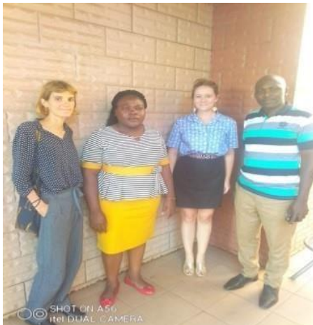
End of workshop picture with PISCCA team